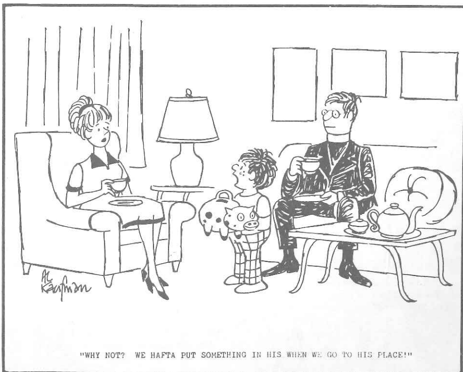
"WHY NOT? WE HAFTA PUT SOMETHING IN HIS WHEN WE GO TO HIS PLACE!"